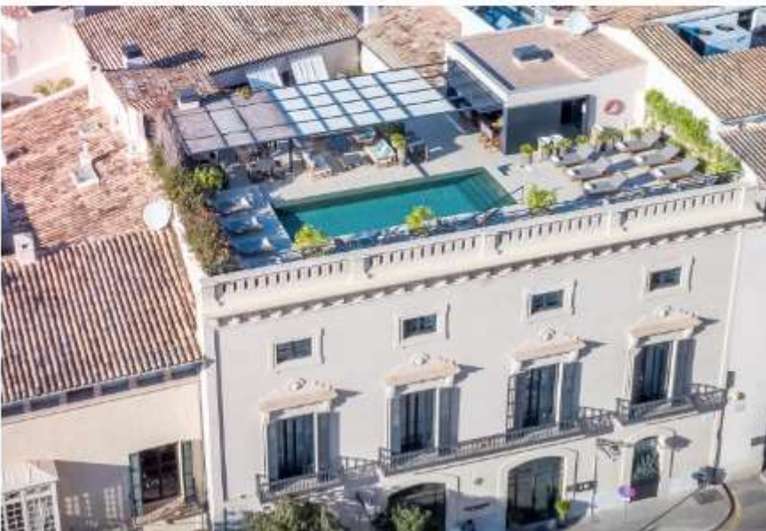
The hotel was built in 1860 and has been lovingly renovated to include a rooftop pool