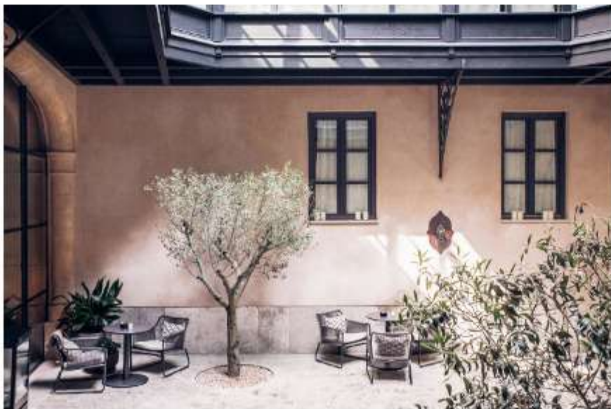
The sunny but shaded patio is one of many relaxing spots around the hotel

This includes a gin tasting session, a tour of the distillery and of course, four refreshing gin cocktails. The master distiller will explain the tricks of the trade, the process of gin making and give insider tips on how to distill your own at home.