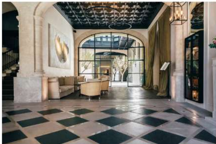
An exceptional collection of art can be seen throughout the hotel