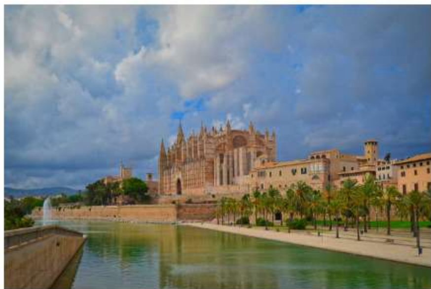
Palma has many sights to explore, including the stunning cathedral

Foodies will delight with a meal at relaxed, fine-dining restaurant Quadrat Restaurant & Garden, serving the finest Mediterranean specialities with a modern twist. Guests can discover the cobbled streets of Palma, steeped in culture and history, right on the hotels doorstep and explore nearby landmarks including the Cathedral, the Royal Palace of La Almudaina, 'La Lonja' or the Arab Baths.