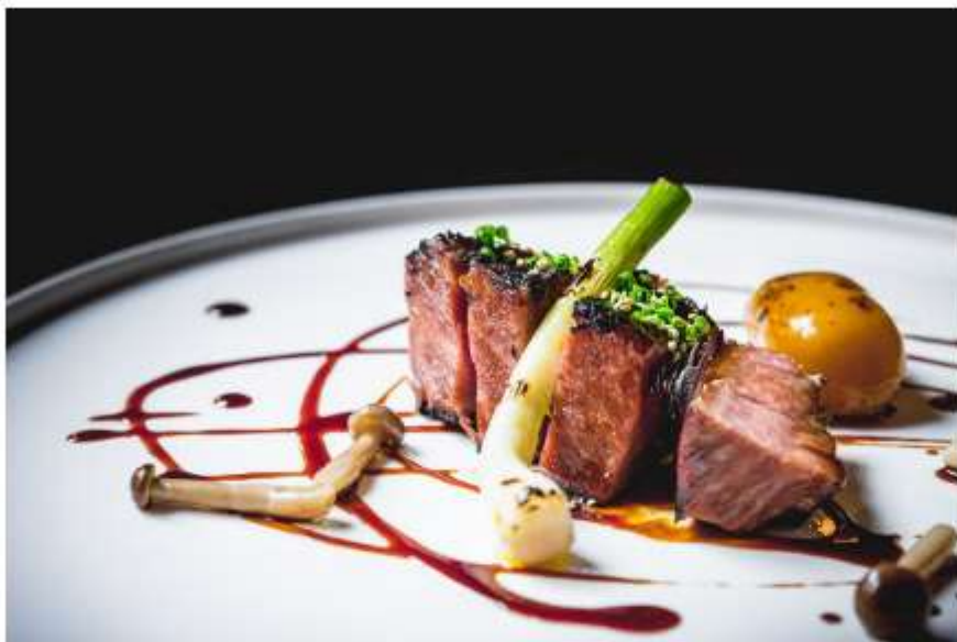
The hotel's Quadrat Restaurant and Garden showcases local Mediterranean cuisine

During the three hour session, guests will be expertly guided through the design process of Mallorca's most famous fashion export – the espadrille. From selecting a pattern to making the esparto rope sole, guests will leave the workshop with their very own handmade shoes, taking a little piece of Palma home with them.