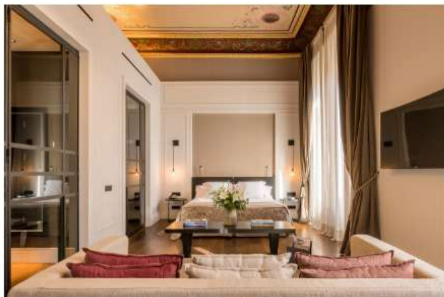
Rooms and suites are stylish and comfortable with luxury touches

The Winter Weekend Package includes a two night stay at Sant Francesc. Set within a former Mallorcan mansion, the hotel was originally built in 1860, and lovingly restored in 2015.