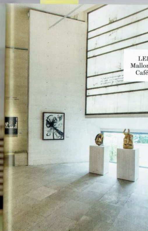
LEFT Inside the Miró Mallorca Fundació. RIGHT Cafés in Santa Catalina