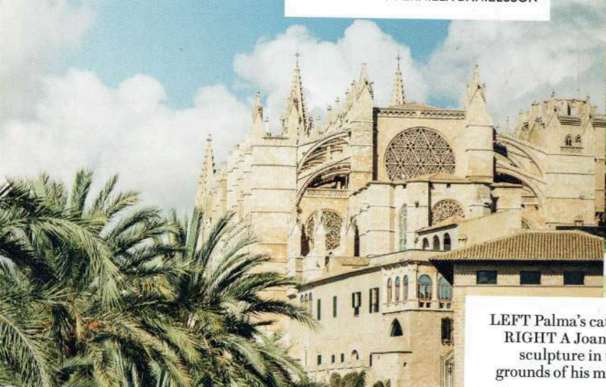
LEFT Palma's cathedral. RIGHT A Joan Miró sculpture in the grounds of his museum