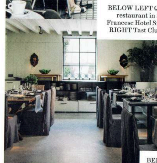
BELOW LEFT Quadrat restaurant in Sant Francesc Hotel Singular. RIGHT Tast Club's bar

If good bone structure signals great beauty, Sant Francesc Hotel Singular had a head start when it was converted from a grand, but near-derelict, private house into Palma's most exquisite boutique hotel in 2015. Set on the enchanting Plaça de Sant Francesc, which is dominated by the eponymous thirteenth-century basilica, the neoclassical mansion boasts numerous restored original features - a wide marble staircase, elaborate wooden coffered ceilings, frescoes and stone floors. Into this setting add contemporary art and furniture, an enviable assortment of beautiful books, a collection of specially commissioned photographs and a rich palette of greys, browns and blues, and the result is stunning. The inner courtyard, which some of the 42 rooms overlook, is a peaceful spot for a drink and there is an excellent restaurant, Quadrat, in the former stables and garden. But the pièce de résistance is the rooftop terrace, with its small pool, a bar and a beguiling view of church spires, the mighty La Seu cathedral and a distant glimpse of the Mediterranean. Doubles from €285; hotelsantfrancesc.com