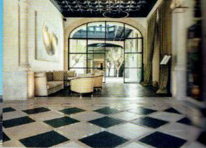
Clockwise from left: the old town setting of Sant Francesc; the hotel's lobby; rooftop pool utopia